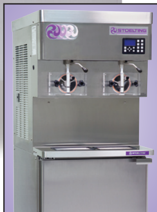
Optional Swing Gate Style Handles